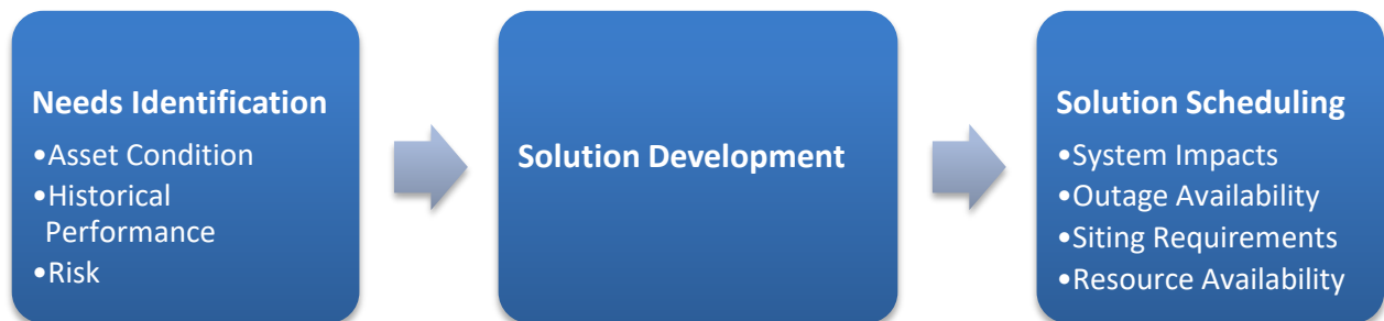
Figure 1 – AEP Process for Identifying and Addressing Transmission Asset Condition, Performance and Risk Needs

AEP’s transmission owner needs identification criteria and guidelines are used for projects that address equipment material conditions, performance, and risk. AEP uses the three-step process shown in Figure 1 and discussed in detail in this document to determine the best solutions to address the transmission owner identified needs and meet AEP’s obligations and responsibilities. This process is completed on an annual basis. In developing the most efficient and cost-effective solutions, AEP’s long-term strategy is to pursue holistic transmission solutions in order to reduce the overall AEP transmission system needs.